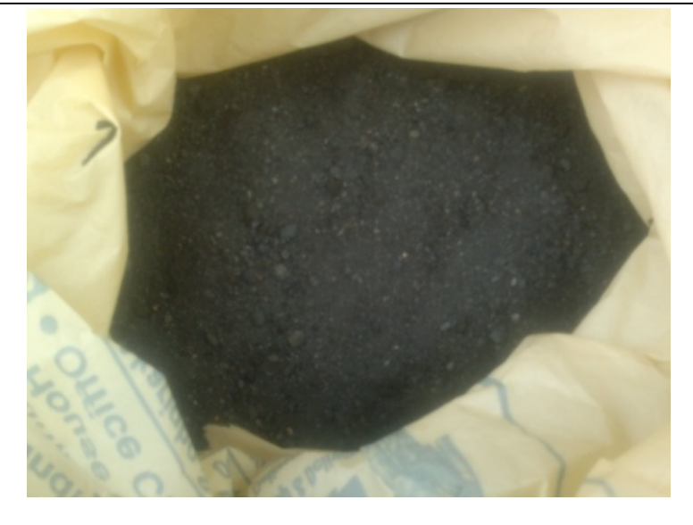
Figure 1: Foundry Sand Sample

The construction industries rely heavily on conventional materials such as cement, granite and sand for the production of concrete. The high and increasing cost of these materials has greatly hindered the development of shelter and other infrastructural facilities in developing countries. There arises the need for engineering considerations for the use of cheaper and locally available materials to meet desired need to enhance self efficiency and lead to an overall reduction in construction cost for sustainable development (Olutoge, 2010).