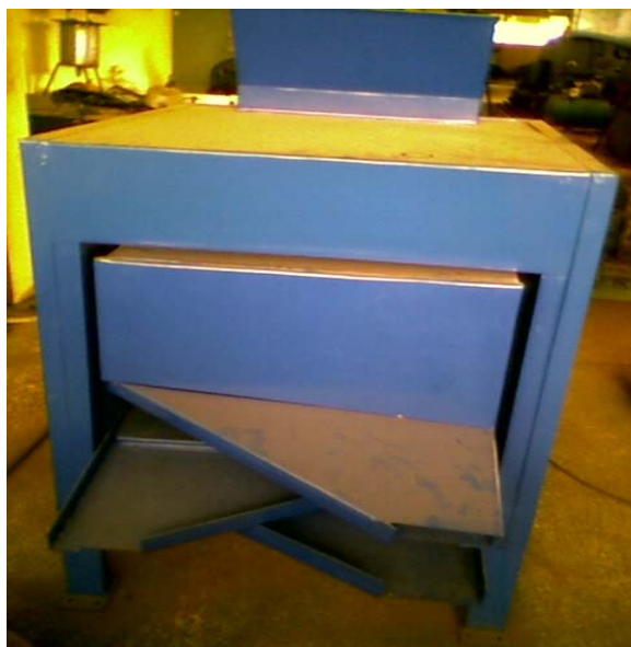
Figure 3: Front view of the fabricated air-screen cleaner