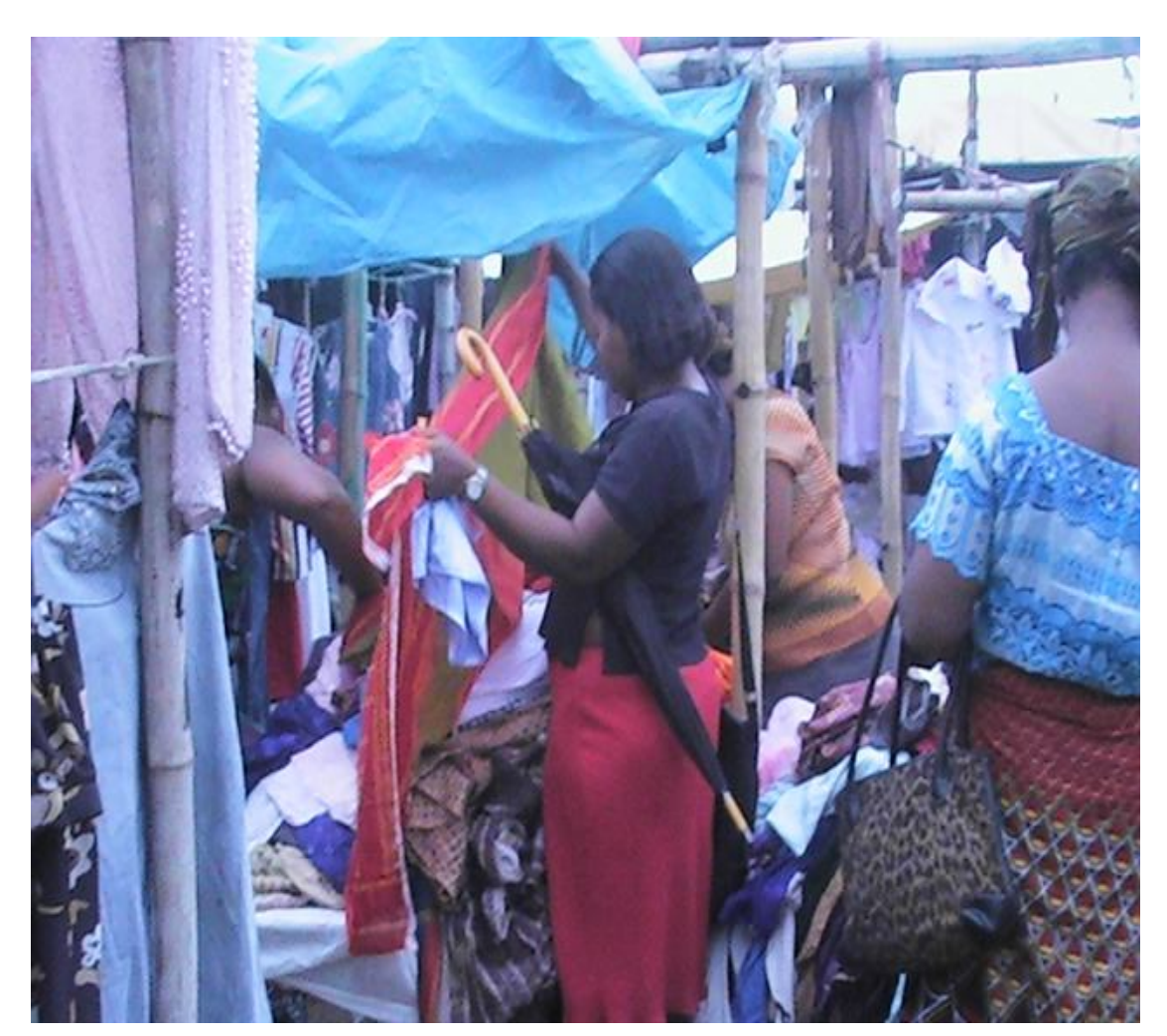
Plate 1: Consumers selecting clothes in a second hand market.

helping consumers gain the skills, right attitudes and knowledge they need to be able to gear the choices they make as consumers to their economic interest and to protect their health and safety" (Brennan and Ritters, 2004).