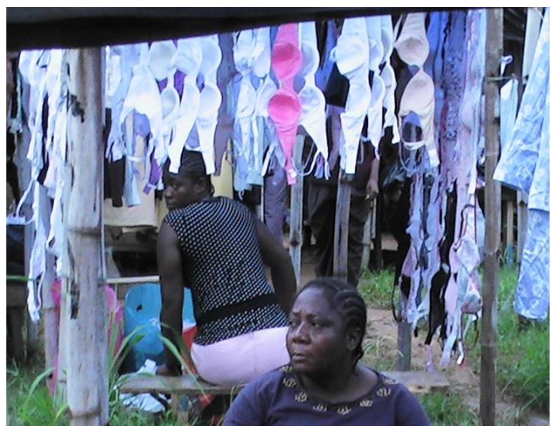
Plate 2: Non-sterilized used bra on display at Second Hand Market.