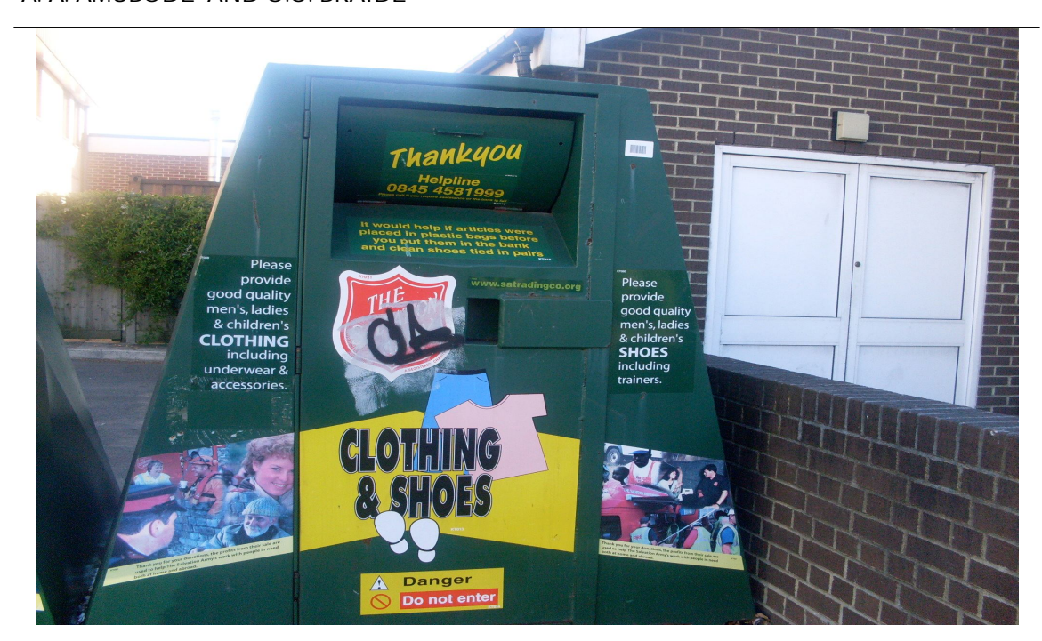
Plate 3: Photograph of a collection centre for second hand clothing items in Southampton, England