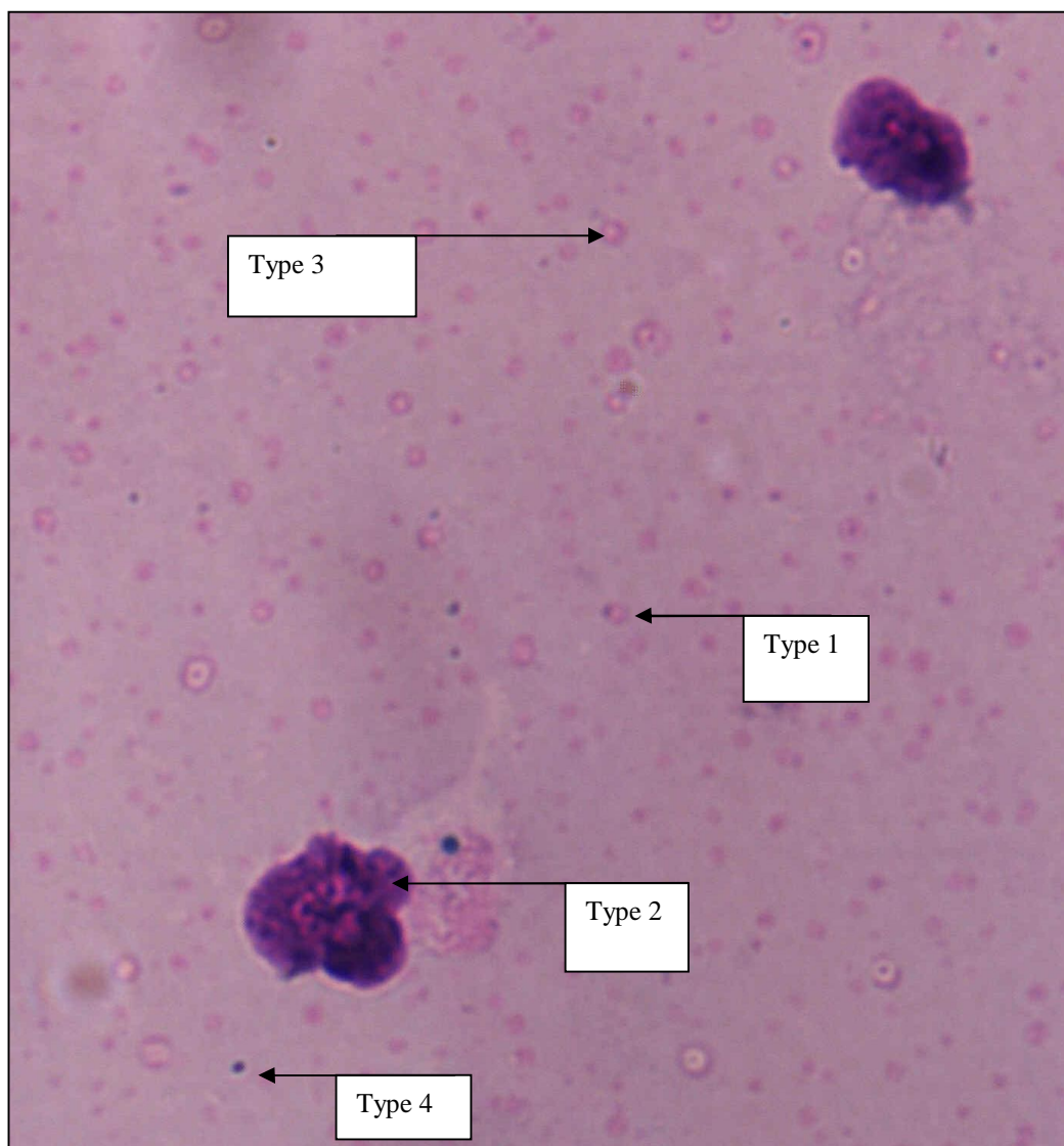
Plate 2: Photomicrograph of different haemocytes types found in haemolymph of A. marginata (x 400)